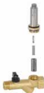
Simple to service