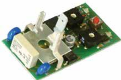
Highest quality PCB

Power and alarm connectors DIN 43650-A Environmental protection rating IP65 (NEMA4)