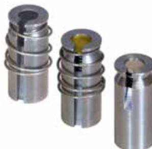
Service kits available