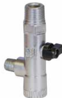
High pressure stainless steel ball valve strainers are available