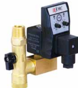
Accessories include ball valve strainers