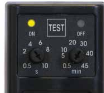
Bright LED illumination, indicating operating status