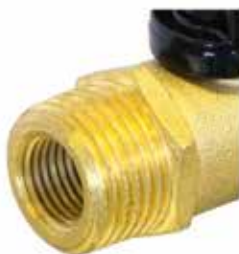
Dual inlet feature 1/2" and 1/4"