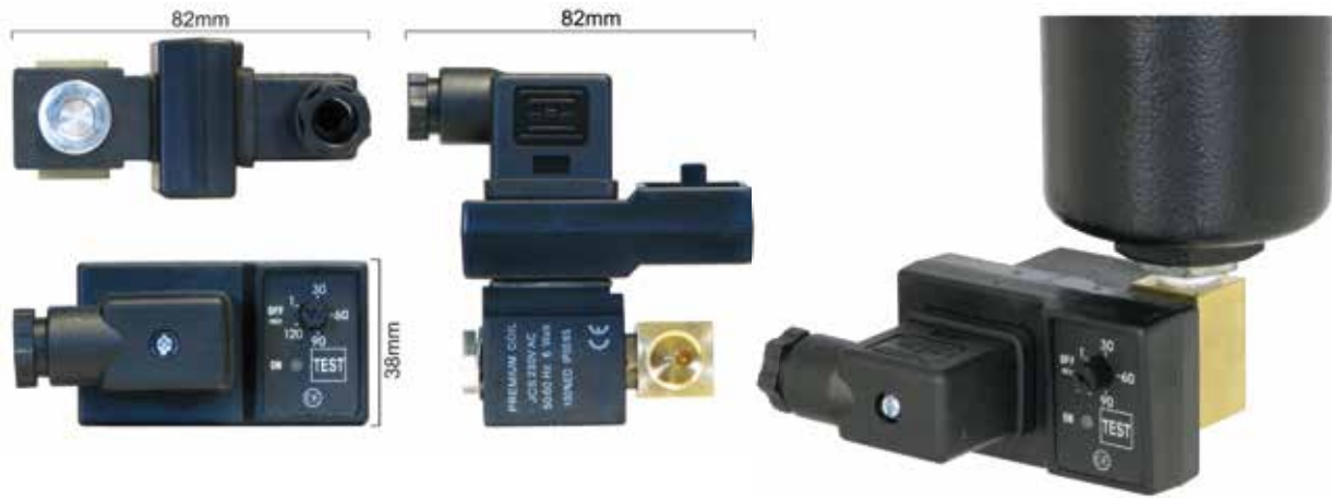
Inline installation under compressed air filters.