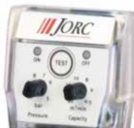
Private labelling possible