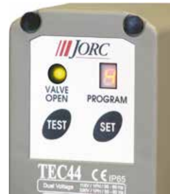
Bright visual display of selected program!