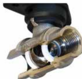
Stainless steel rotating ball