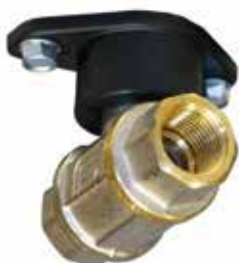
Nickel plated valve