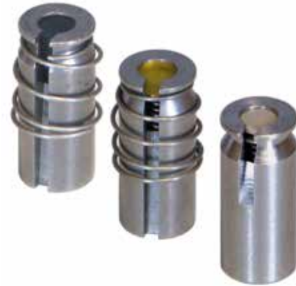
The right seal for the right job!