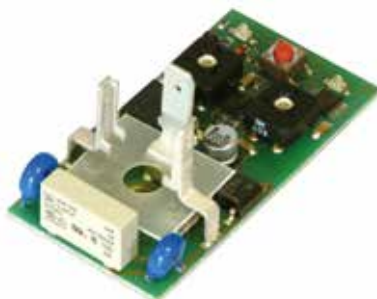
Highest quality PCB