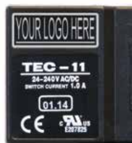
Private labelling possible