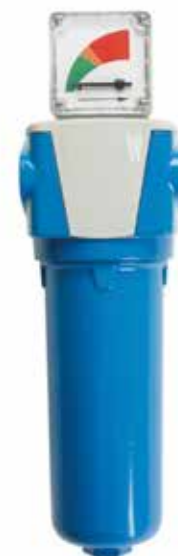
Install under any filter