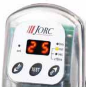
Visual display of current operating cycle