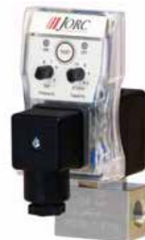
The Quick-Set timer can be mounted on any JORC DIN form A type solenoid valve.