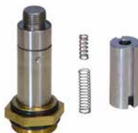
Service kits available