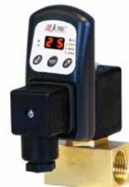
Also available with a FLUIDRAIN valve