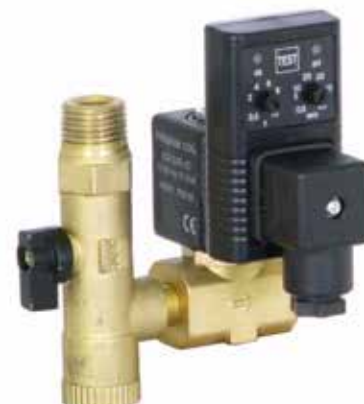
Accessories include ball valve strainers