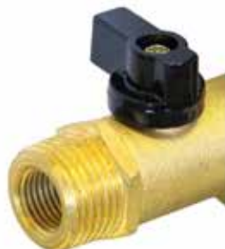
Shut off valve incorporated