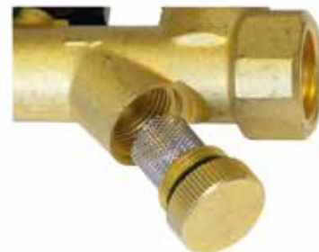
Integrated mesh strainer