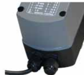
Remote switch option